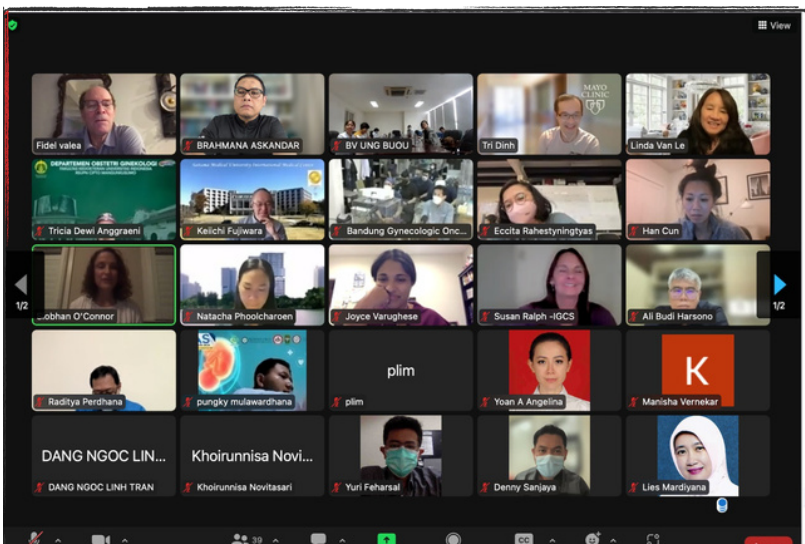
IGCS Tumor Board