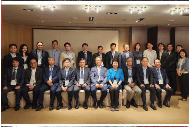
ASGO COUNCIL MEMBER MEETING 2023